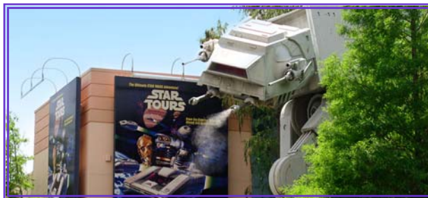
Below: Star Tours, Dinosaur