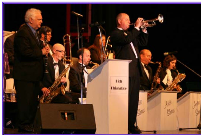
ASO onstage at Central Dauphin HS on October 20th

The ASO played many of the big Shaw tunes, of course leading off with the King of The Clarinets' haunting theme song, Nightmare, and running the gauntlet during a first set that included Swonderful, Moonglow, Frenesi, and the