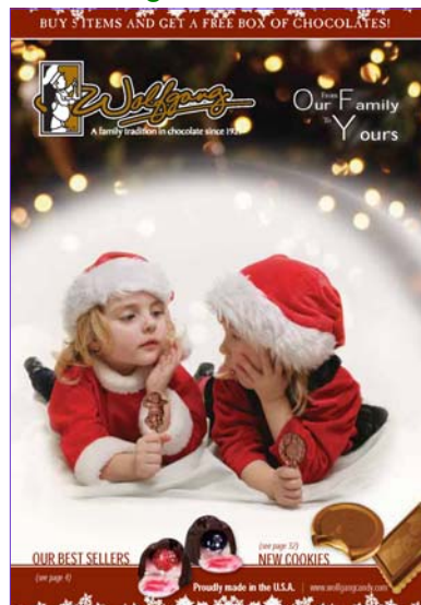
The cover of the Fall 2009 Wolfgang Candy Catalog. The boosters make up to 40% on sales; 70% of that goes directly into your student account!