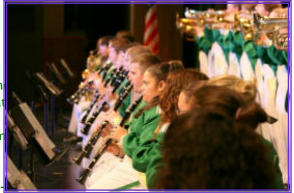
RamBand on Stage for the 2008 KeyNotes Concert. Join us for the 2009 concert/ice cream social on November 7, 2009 at 7:00pm.

The Central Dauphin High School Marching Band will present its annual KeyNotes Concert, featuring musical highlights from this year's marching band season, Saturday, November 7, 2009, at 7:00 p.m. at the Central Dauphin High School Auditorium. An Ice Cream Social will follow.