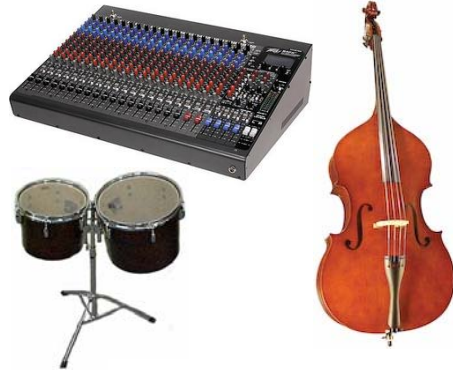
Clockwise starting above: A new Peavey 24FX mixing console for the Indoor Ensembles and marching band; the new Blonde in the Band Room... it's a string bass; and new timbales.

• New sound equipment for the indoor units and marching band. Many thanks to those who have