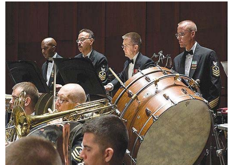
U.S. Navy Concert Band percussion section performs during a 2010 concert.

We hope to see you on March 31 at Central Dauphin!!