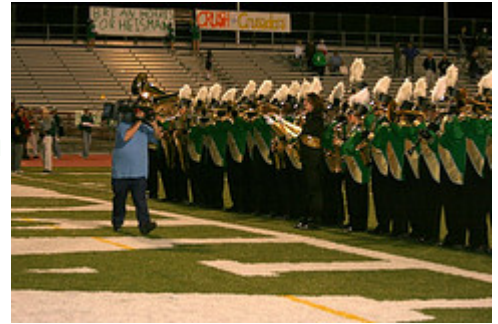
Local news cameraman filming the RamBand performing post-game in the end zone after the Rams defeated Bishop McDevitt last fall.