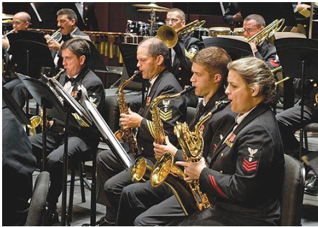
U.S. Navy Concert Band musicians perform at the 2010 holiday concert in Washington.

Through ceremonies, national tours, public concerts, and recordings, the Navy Band inspires patriotism, elevates esprit de corps, enhances Navy awareness and public relations, supports recruiting and retention efforts, preserves our nation's musical heritage, and projects a positive Navy image at home and abroad. With a repertoire ranging from clas-