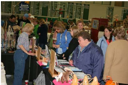
Part of the early shopping crowd at the 2010 Spring Craft Show. Join us on April 9 for the 2011 show!

So we're going to have another great turnout with scores and scores of terrific crafters. The planning is now about complete: Now it's time for all boosters to step up and help. The Craft Show is a significant fundraiser — it's our biggest one-day fundraising event — and requires many man-hours and