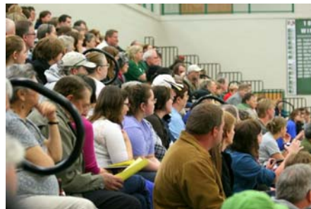
The crowd takes in a performance at the 2010 Indoor-RAMa competition at CDHS.

The show will begin at 1:00pm and run through approximately 8:00pm. We'll need lots of help with set up before the start of the show, throughout the day during the show, and for clean up after the show. It will be an entire day filled with lots of work, and lots of fun too, interacting with the many students and families visiting our amazing facility. Indoor-RAMa has quickly become a great event not only because we can show off our great program but also because we