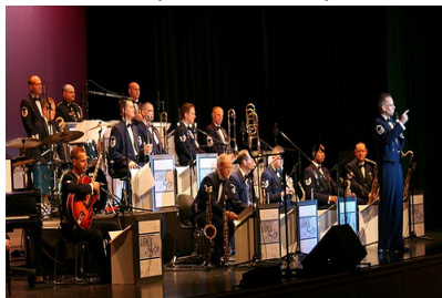
Airmen of Note perform at Central Dauphin HS on November 22, 2010.