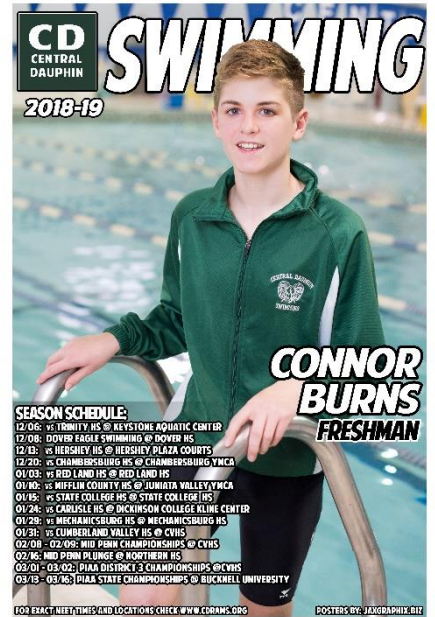
SAMPLE POSTER Pose chosen by Jax Graphix and photographer based on poster layout.